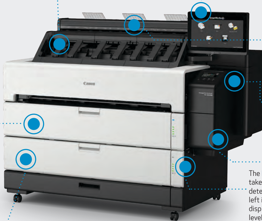
TZ-30000 MFP Z36 model shown.

The Roll Paper Indicator takes the guesswork out of determining how much paper is left in the printer. The LED lights display four (4) different media levels, letting you know when paper is running low.