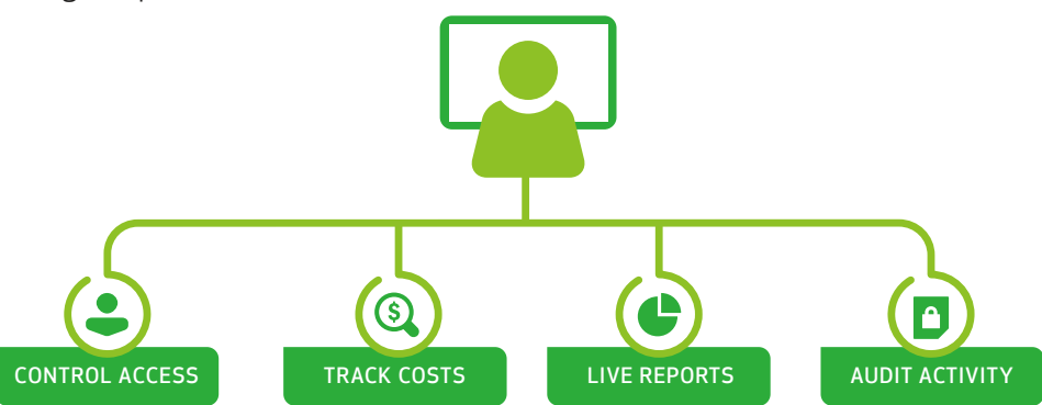
Note: Products offer certain security features, yet many variables can impact the security of your devices and data. Canon does not warrant that use of its features will prevent security issues. Nothing herein should be construed as legal or regulatory advice concerning applicable laws; customers must have their own qualified counsel determine the feasibility of a solution as it relates to regulatory and statutory compliance.

mxHERO Secure Scan to Email. Get better security, control, and tracking of those documents you scan to email with intelligent uploading and sharing via secure cloud storage links. Simply scan a document to email using the device-native Universal Send functionality, uniFLOW, or Authorized Send. It's then routed with encryption to mxHERO's Secure Scan to Email service and automatically moved to the user's supported cloud storage service. An email with a cloud storage link is then sent to the original destination of the scanned document. This optional solution offers an added layer of security without any process change for the user.